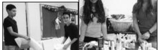
ABOVE: TEEN VOLUNTEERING AT HOUSING THE HOMELESS