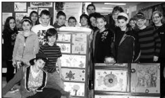
RELIGIOUS SCHOOL NEWS CONTINUED ON PAGE 11