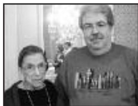
WITH JUDGE GINSBURG

MANY PEOPLE ASKED what I was up to when I was away at the end of December. I was in Florida at the 90th Annual Meeting of Tau Epsilon Rho Law Society. This is the oldest professional association of Jewish lawyers in the country (although we are now open to everyone). Many of our congregants who practice law are or were TER members at some point during their law school days or professional career. The convention's highlight was presenting Hon. Ruth Bader Ginsburg with our highest award for public service. Even more thrilling, the justice joined us for an educational program the next morning focusing on the Supreme Court and the Constitution. Imagine learning constitutional law from a sitting justice in a small and intimate setting! This is a significant time in the Court's and Jewish legal history, with three Jewish justices sitting on the bench.