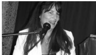
SEE MORE DONOR DAY PHOTOS ON BACK PAGE

WOW DID THIS YEAR go by so quickly. I had a great time meeting new people and getting to know others better. I would like to thank everyone who helped me and supported me during my first year as Sisterhood President; I could not have done it alone.