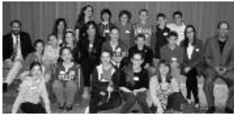
2014 Outreach Luncheon Volunteers

ONCE AGAIN Sisterhood is pleased to host a Spring Outreach Luncheon for clients of JVS, Kadima and JARC. As in past years, our guests will gather together in the social hall for a joyous afternoon. They will enjoy a delicious lunch and take part in festive song and dance with our clergy.