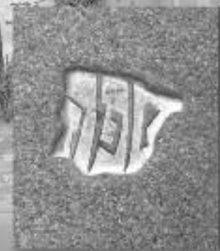
Sephardic Heritage Marker