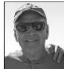
VISITING ISRAEL THIS WINTER