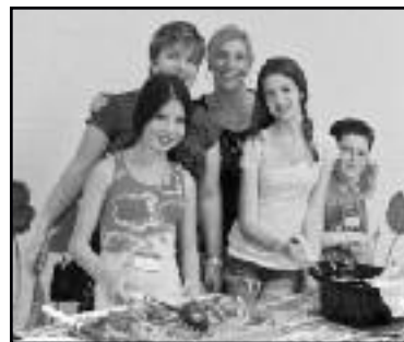
IT WAS ALL ABOUT FAMILIES WORKING TOGETHER DURING HOUSING THE HOMELESS 2015

We have been busy preparing for our guests from the South Oakland Shelter. Coordinating the shopping, meal planning, overnight staff and transportation needs are daunting tasks. We try to plan but we know that the schedule will