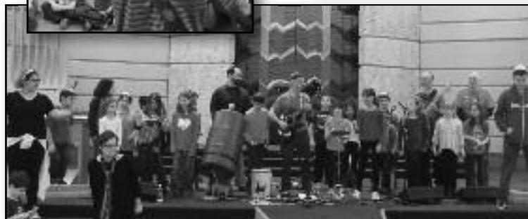
Spirit & joy abounded at Sunday's concert for all ages!