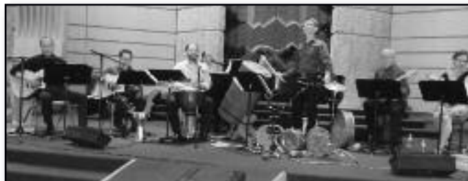
above: a super-lively Shabbat Rocks service