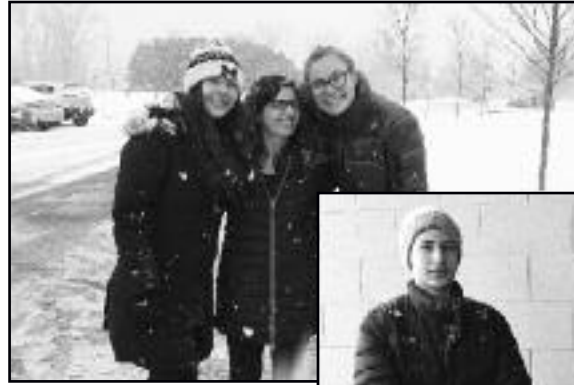
TEENS VOLUNTEERING AT BOOKSTOCK ON A COLD SUNDAY

MAY 29 – Teen Volunteer Corps Housing the Homeless