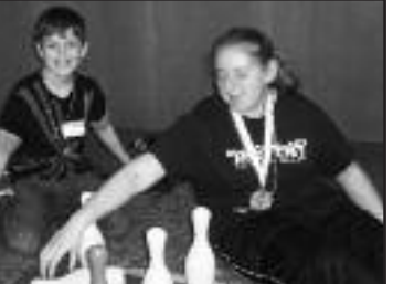
ABOVE: MADRICHIM WORKING AT SCHOOL