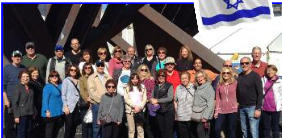
GROUP GATHERING IN TEL AVIV

APRIL 2 Shemini SHABBAT PARAH APRIL 16 Metzora SHABBAT HAGADOL APRIL 9 Tazria SHABBAT HACHODESH APRIL 23 Pesach First Day APRIL 30 Pesach Eighth Day YIZKOR PRAYERS WILL BE RECITED