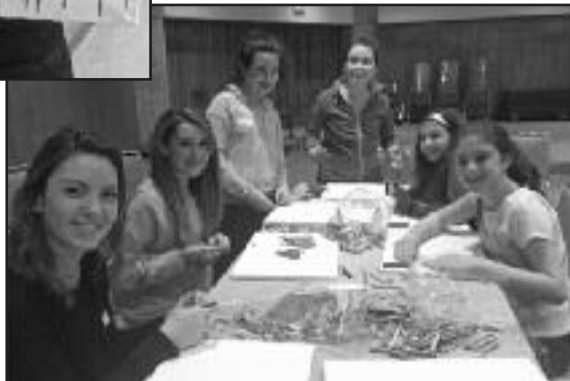
(ABOVE): HAVING A BLAST AT THE CHILL'N NIGHT OF IMPROV COMEDY, ART AND BAKING