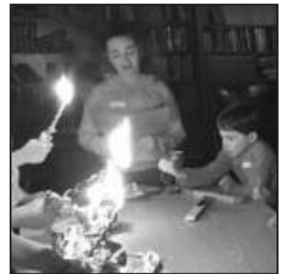
(ABOVE): HAVDALAH LED BY 6TH GRADERS DURING A RECENT YOUTH EVENT