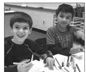
Happy faces at Adat Shalom's Kids' Night Out, November 10