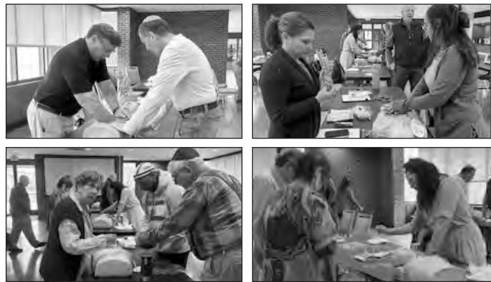
Adat Shalom offered us the opportunity for first aid, CPR, and AED training led by Jewish Community Security Detroit.