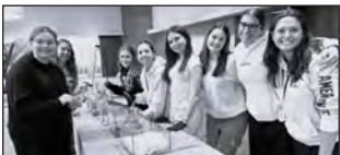
Moving our spring family picnic indoors didn't dampen the fun. Smiles were everywhere as all ages enjoyed this Adat Shalom gathering!