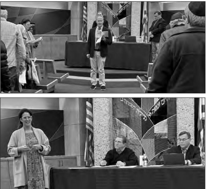
In addition to the elections, the annual meeting is an opportunity to learn more about the offerings and accomplishments of our synagogue, our financial situation, and pay our respects to those who have passed this year during the annual memorial service.