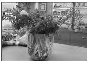
For your home.