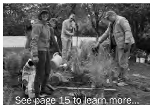
See page 15 to learn more...