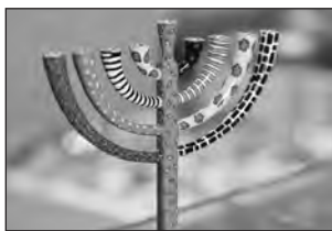
For a meaningful gift.